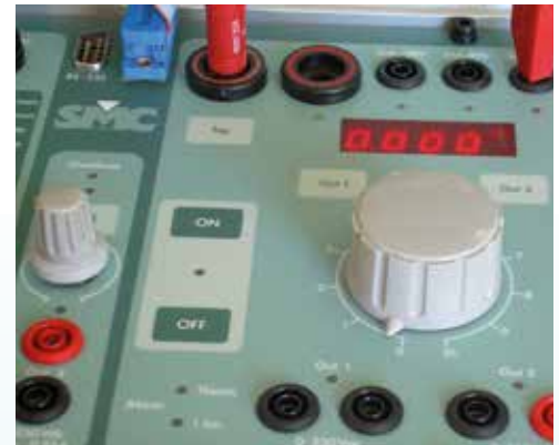
Ergonomically designed control panel for accurate and fast testing

Adjustable voltage: 0-140 V, 40-70 Hz, 0-359.9°